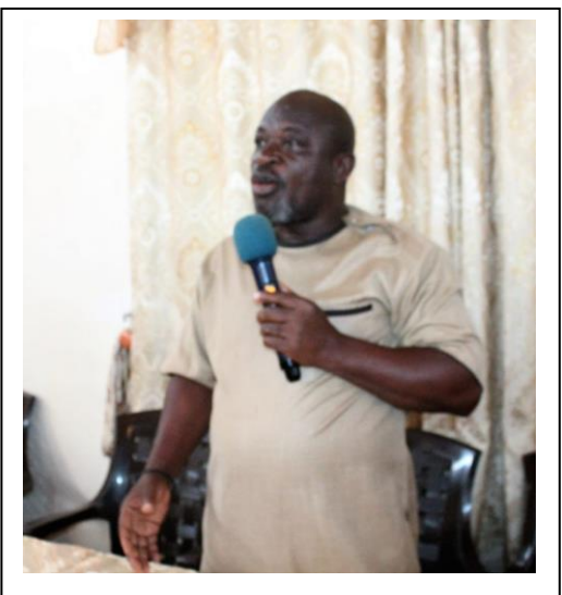
City Council Member making a remark