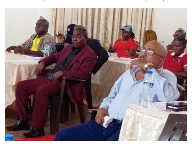
Participants and the Buchanan City Major