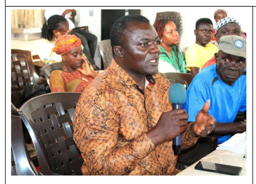
Participant making remark