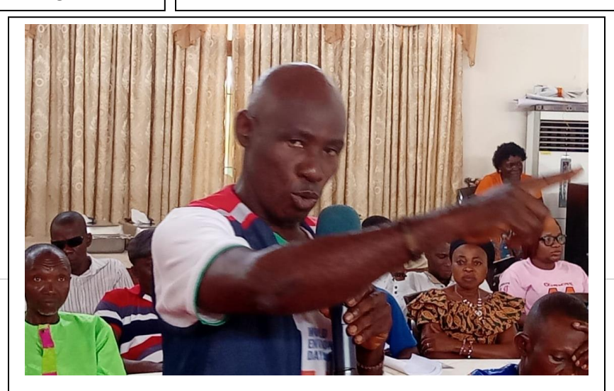
11 | Page