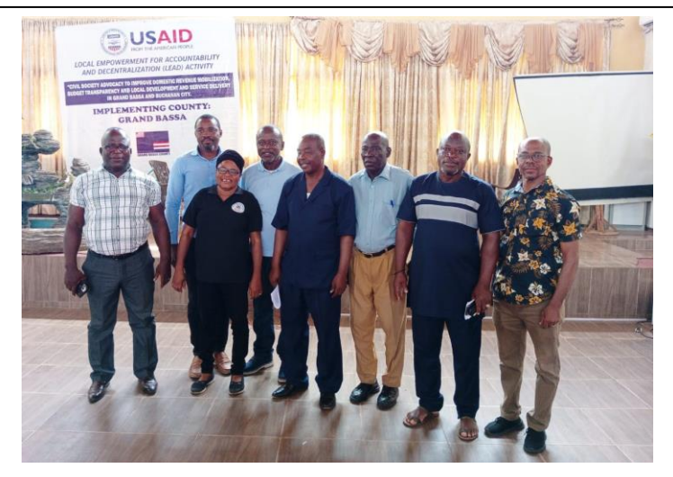
Panelist and City Council Members